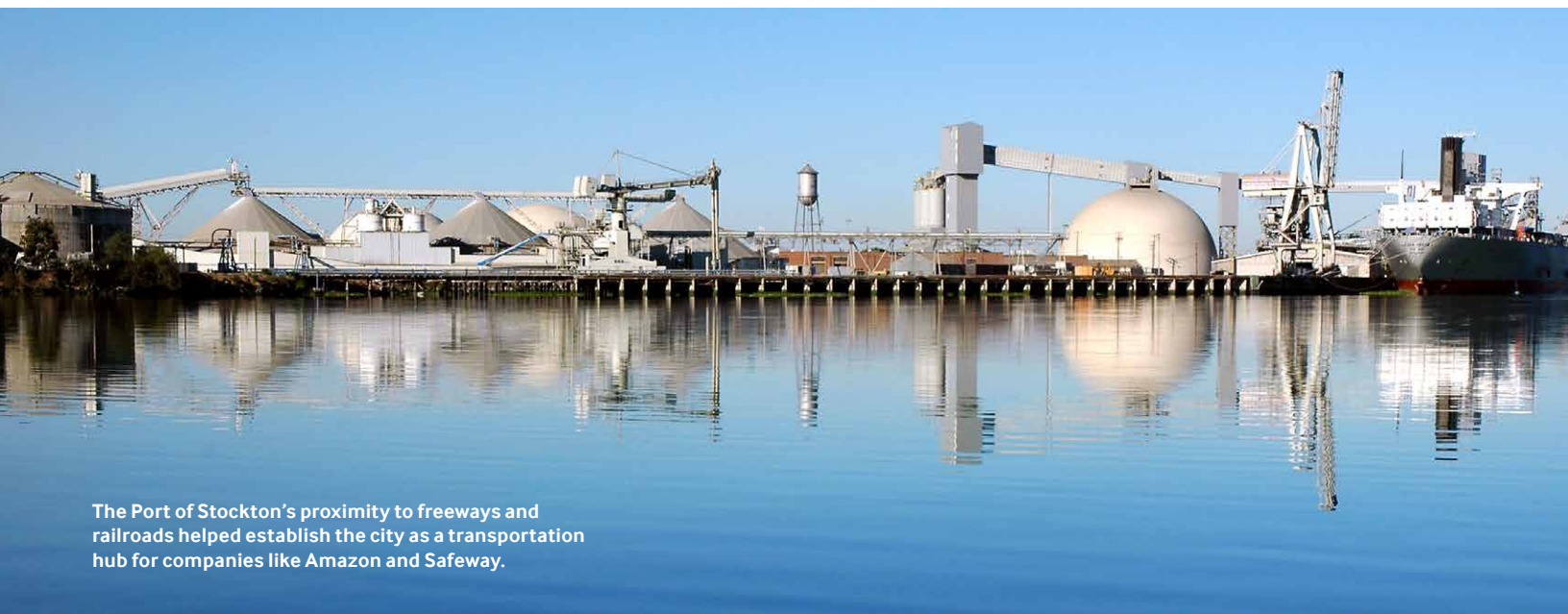
The Port of Stockton's proximity to freeways and railroads helped establish the city as a transportation hub for companies like Amazon and Safeway.

Stockton is one of 306 hospital referral regions, or regional markets for health care, in the U.S. The area of 595,000 residents includes the city of Stockton and most of surrounding San Joaquin and Calaveras Counties. On the Commonwealth Fund's Scorecard on Local Health System Performance, 2016 Edition , Stockton, along with Akron, Ohio, improved on more performance measures (19 of 33) than any other region (Exhibit 1). In comparing the performance of U.S. hospital referral regions, the